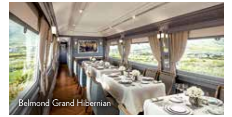
Belmond Grand Hibernian