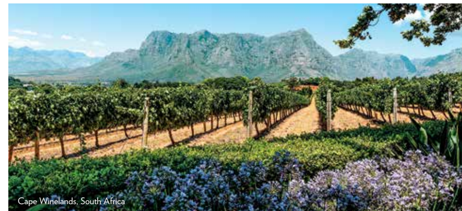
Cape Winelands, South Africa