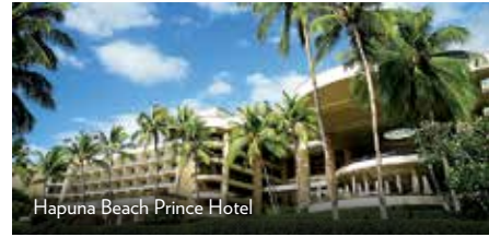
Hapuna Beach Prince Hotel