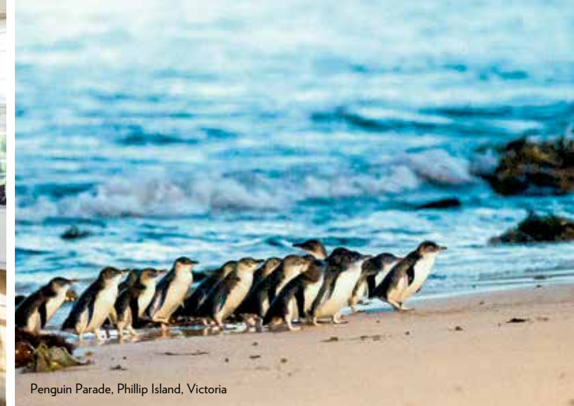
Penguin Parade, Phillip Island, Victoria