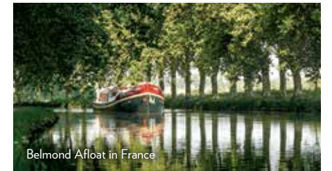
Belmond Afloat in France