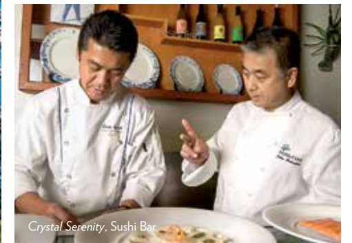
Crystal Serenity, Sushi Bar