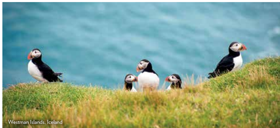
Westman Islands, Iceland