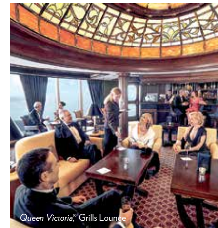
Queen Victoria® Grills Lounge