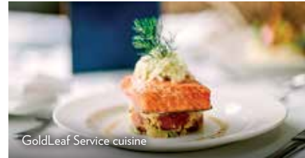
GoldLeaf Service cuisine