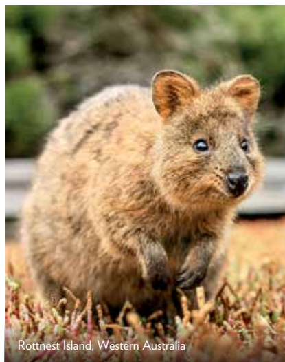
Rottnest Island, Western Australia

from Western Australia's city of Fremantle, near Perth. Aboard a catamaran, tuck into a ploughman's lunch or plunge into the balmy waters from the ship's swim platform.