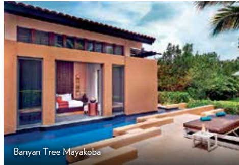
Banyan Tree Mayakoba