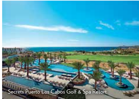
Secrets Puerto Los Cabos Golf & Spa Resort