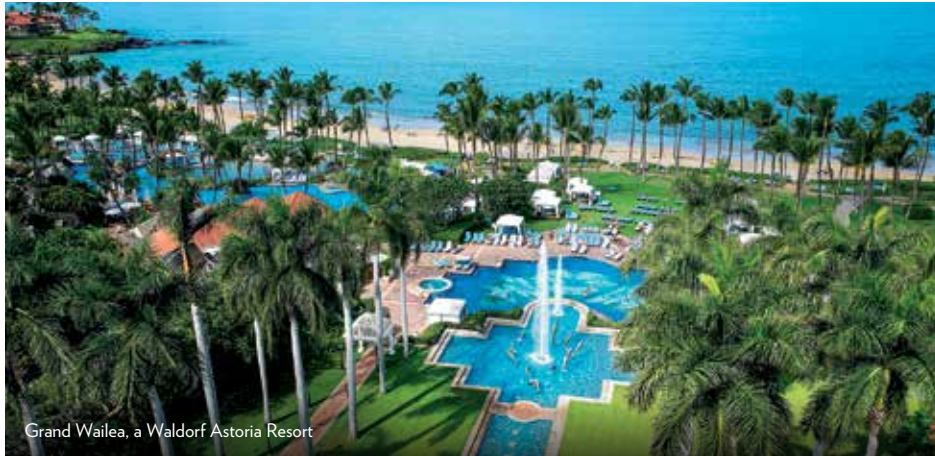
Grand Wailea, a Waldorf Astoria Resort