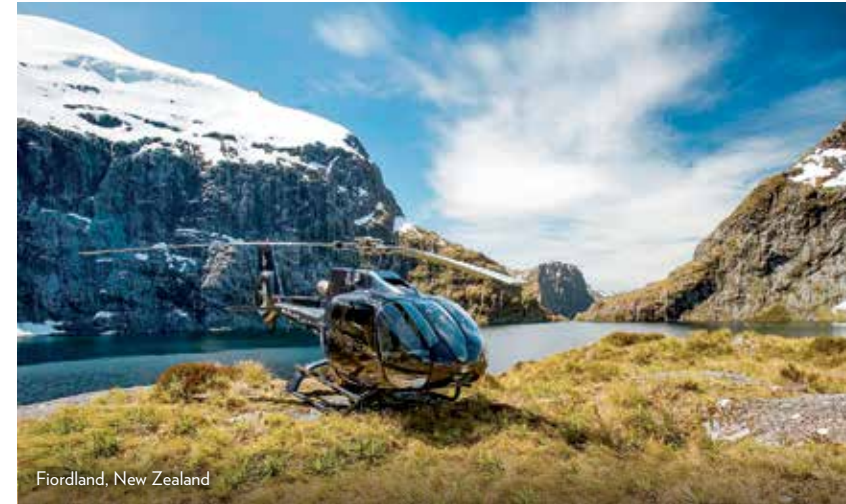
Fiordland, New Zealand

Prices are per couple in U.S. dollars, land only, based on double occupancy, subject to availability and change without notice and are not guaranteed until paid in full. Prices and amenities may vary by category and travel date. International airfare is additional. Additional restrictions, terms and conditions may apply.