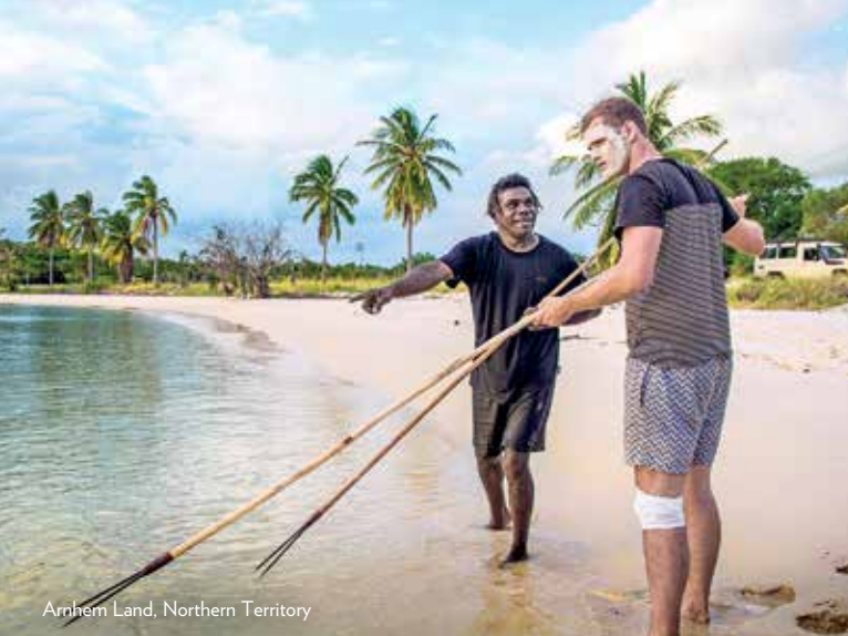
Arnhem Land, Northern Territory