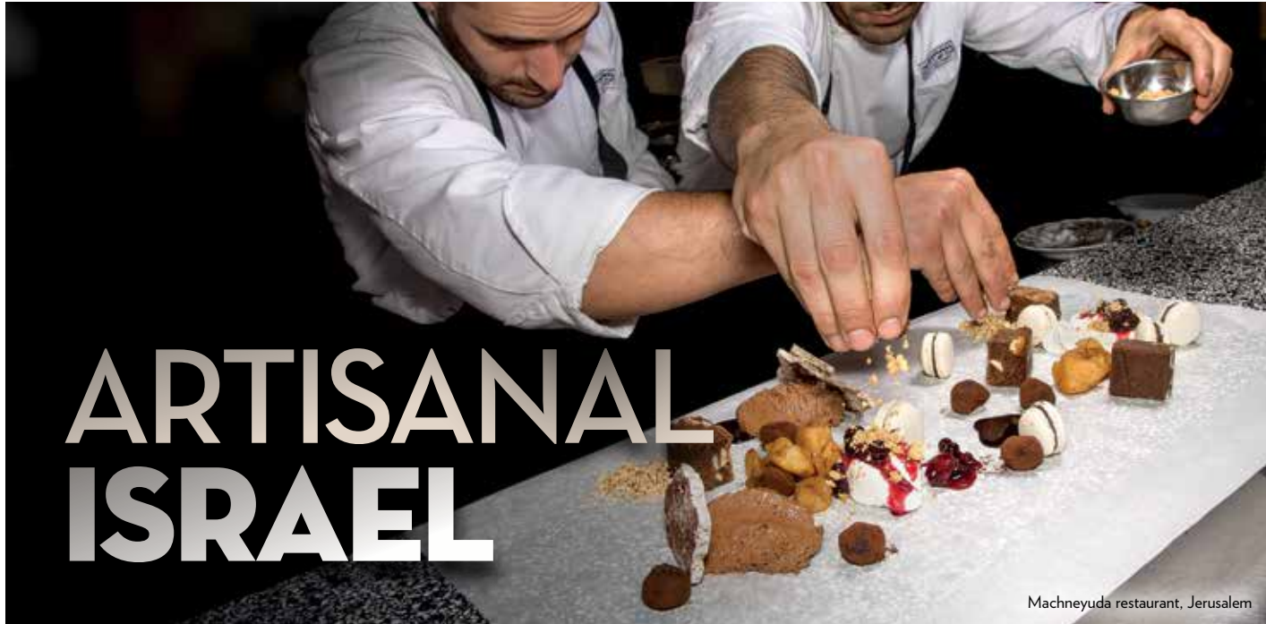
Machneyuda restaurant, Jerusalem