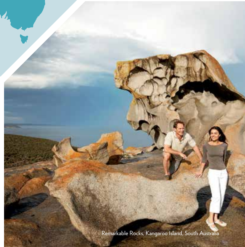
Remarkable Rocks, Kangaroo Island, South Australia