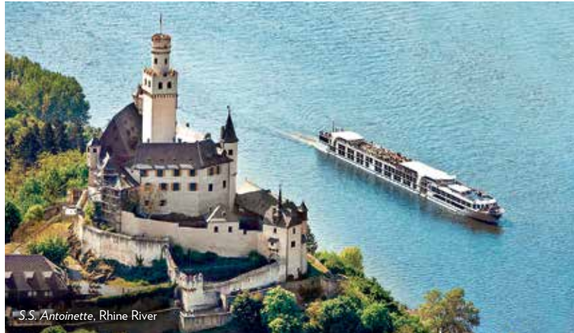
S.S. Antoinette, Rhine River