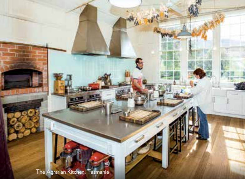
The Agrarian Kitchen, Tasmania