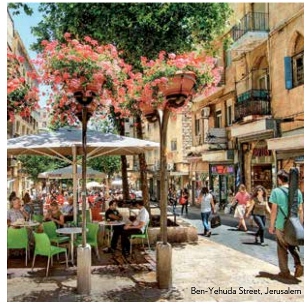
Ben-Yehuda Street, Jerusalem