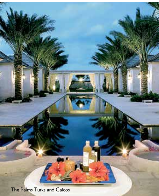
The Palms Turks and Caicos

Pair elegant service with the unspoiled setting of Maui's Polo Beach, formed by two sandy crescents, and you'll understand why The Fairmont Kea Lani, Maui is an island paradise. This all-suite and villa retreat on the southern shores of Wailea remains at the ready with prompt attention from a knowledgeable concierge, around-the-clock room service and even a fitness center accessible at any hour. Indeed, wellness at The Fairmont Kea Lani, Maui was a top consideration of the hotel's recent renovation, which totaled $70 million. With Hawaiian treatments like a poolside scalp massage and a soothing pālolo (mud) bar, plus private yoga instruction and personal training, it's clear why Travel + Leisure declared the 9,000-square-foot Willow Stream Spa