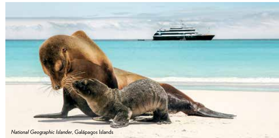
National Geographic Islander, Galápagos Islands