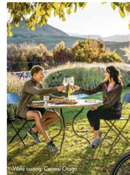
Wine tasting, Central Otago