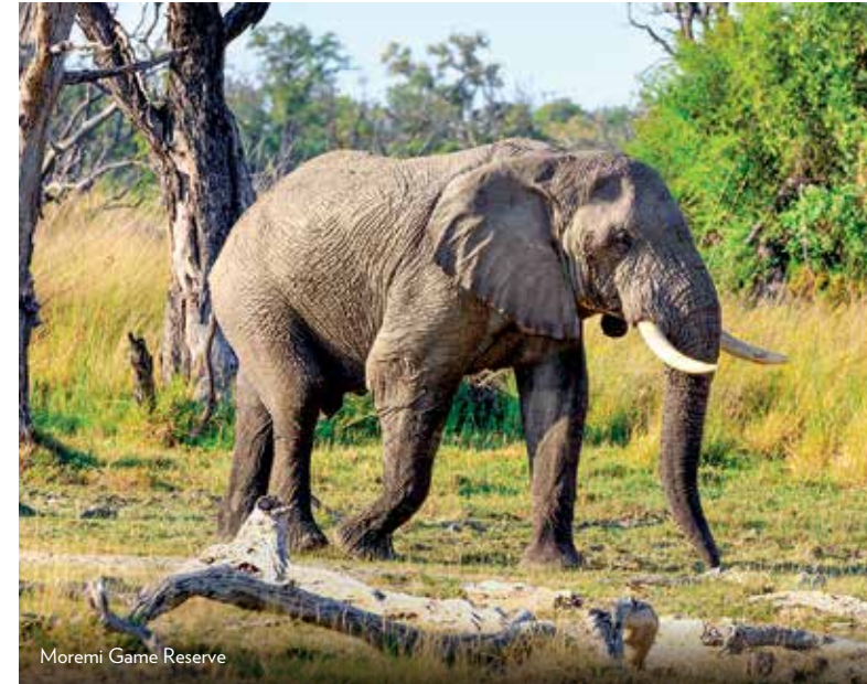
Moremi Game Reserve

4 NIGHTS from $2200 Valid for new reservations made by 4/23 for select travel dates 8/20 – 12/22/16 OFFER 1225835