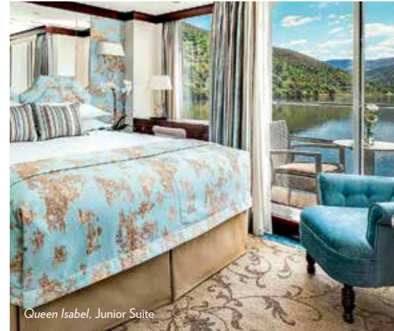
Queen Isabel, Junior Suite