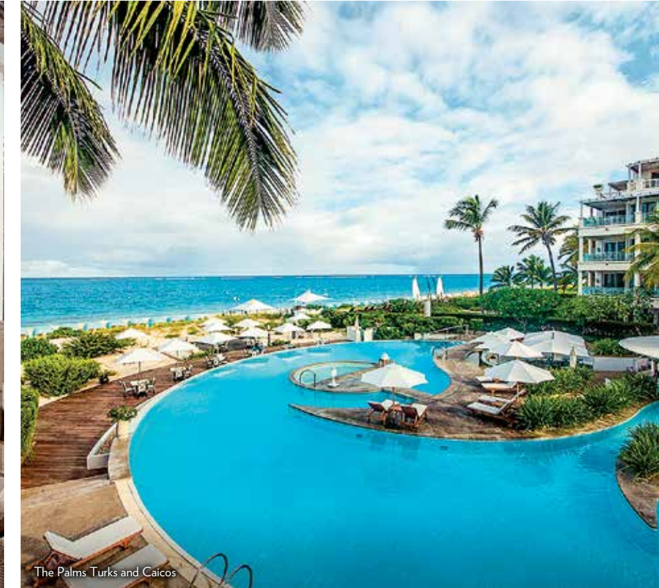
The Palms Turks and Caicos

Imagine how aristocrats of days past roamed the world, and then bring those regal moments to life on your next luxury vacation. With nearly 40 years of experience serving discerning travelers, the curators at Journese SM hand-select hotels that offer unmatched service and VIP treatment. Here,