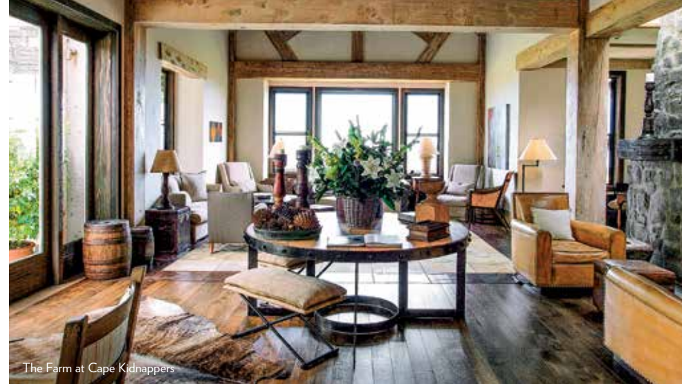
The Farm at Cape Kidnappers

The wine trail begins in Hawke's Bay on the eastern coast of the North Island. Terroir ranges from gravelly coast to clay-and-limestone hill country, and 70-plus wineries are acclaimed for producing some of our favorite Bordeaux-style blends of merlot, cabernet sauvignon and malbec. Nearby is the Art Deco town of Napier, as well as the world's largest and most accessible gannet colony where you can watch thousands of these birds skydiving into the sea. At The Farm at Cape Kidnappers — an enchanting resort where 22 suites look over a dramatic headland jutting into the Pacific Ocean — a 6,000-acre farm supplies the ingredients for meals such as duck glazed with manuka honey paired with rare selections from its own cellar.