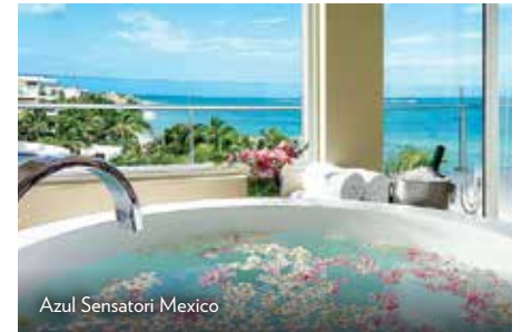
Azul Sensatori Mexico