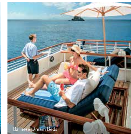
Balinese Dream Beds