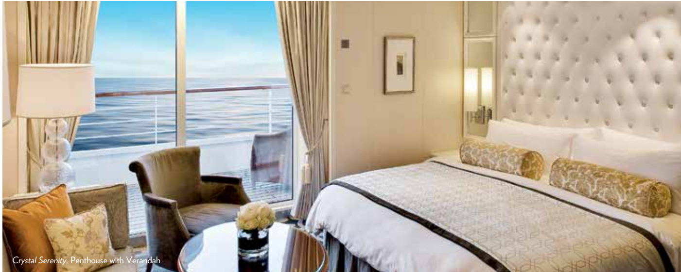
Crystal Serenity, Penthouse with Verandah