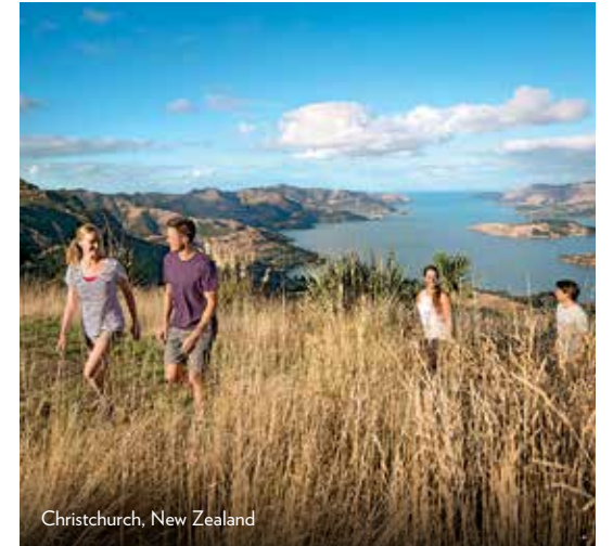
Christchurch, New Zealand