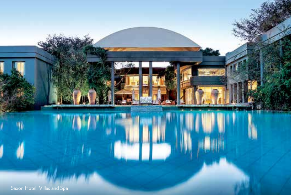
Saxon Hotel, Villas and Spa