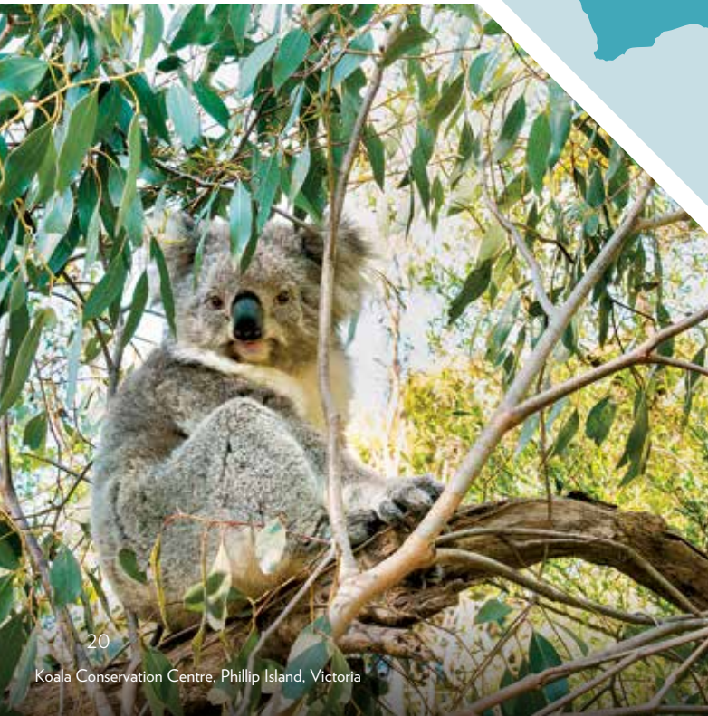
Koala Conservation Centre, Phillip Island, Victoria