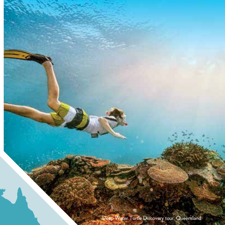
Deep Water Turtle Discovery tour, Queensland