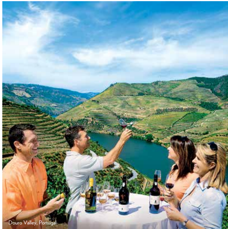
Douro Valley, Portugal