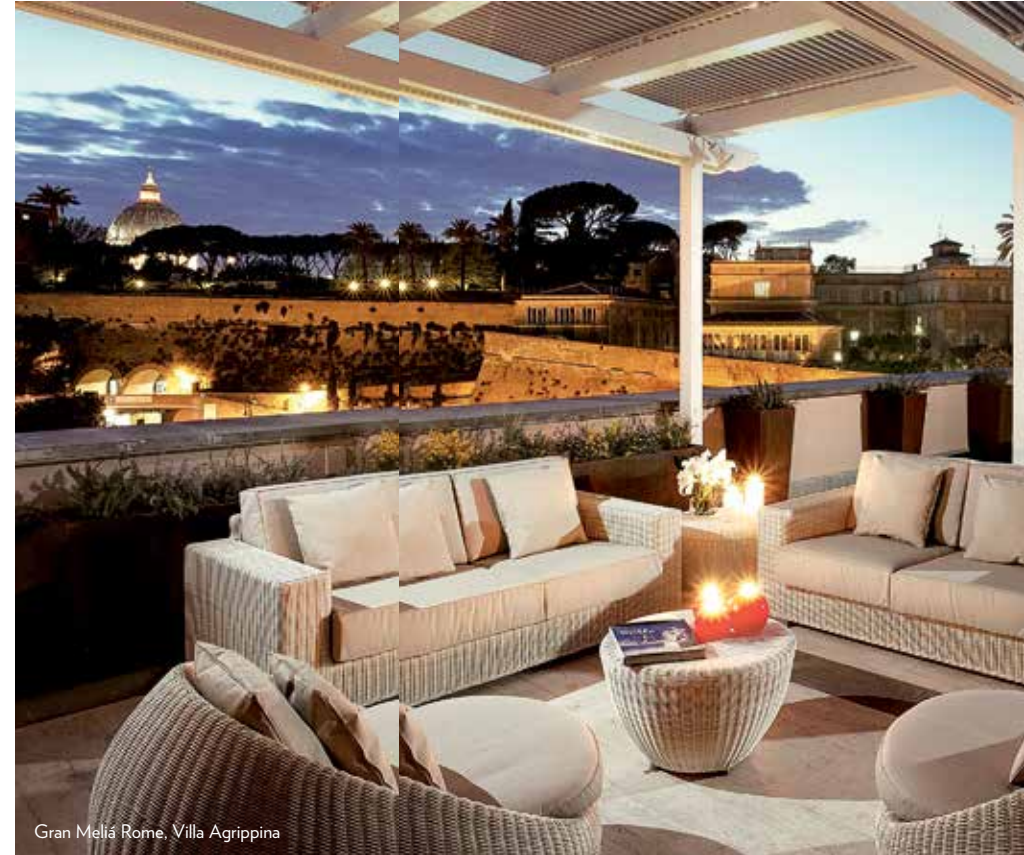
Gran Meliá Rome, Villa Agrippina