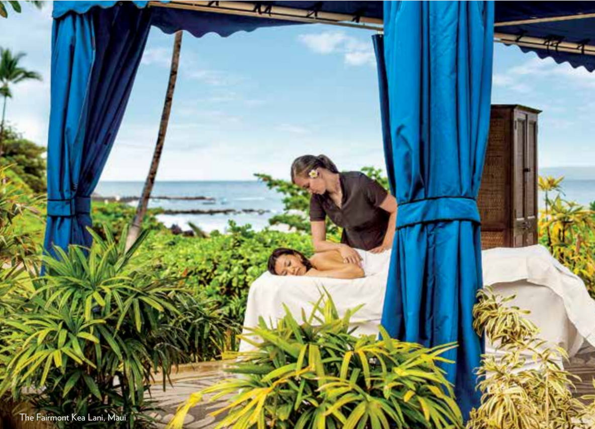
The Fairmont Kea Lani, Maui