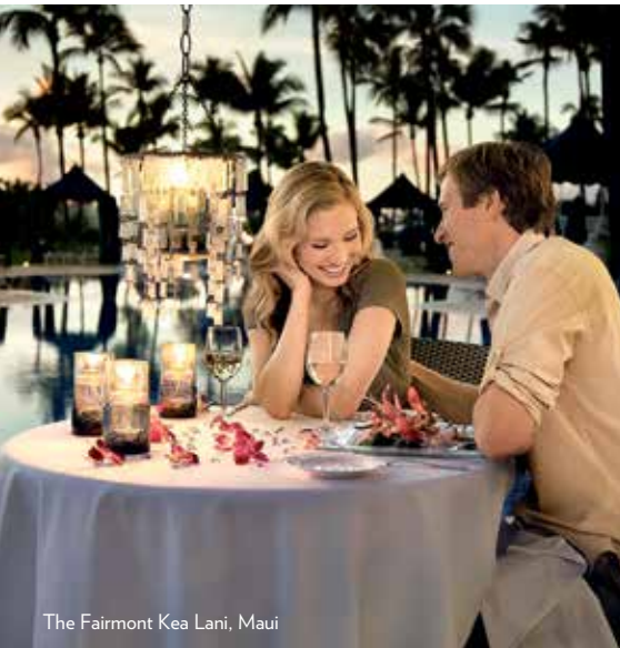
The Fairmont Kea Lani, Maui