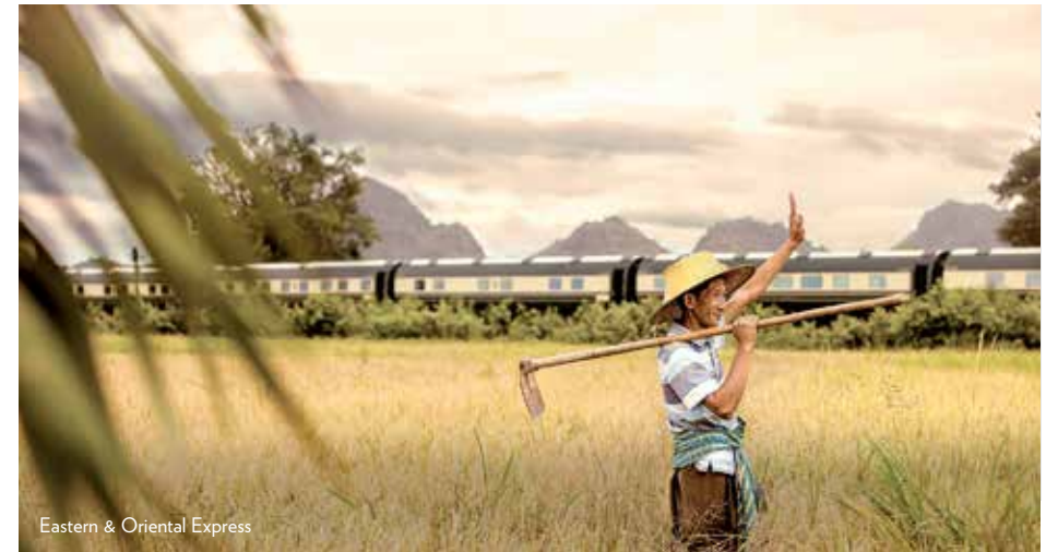
Eastern & Oriental Express