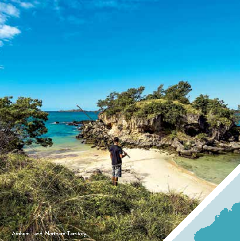
Arnhem Land, Northern Territory