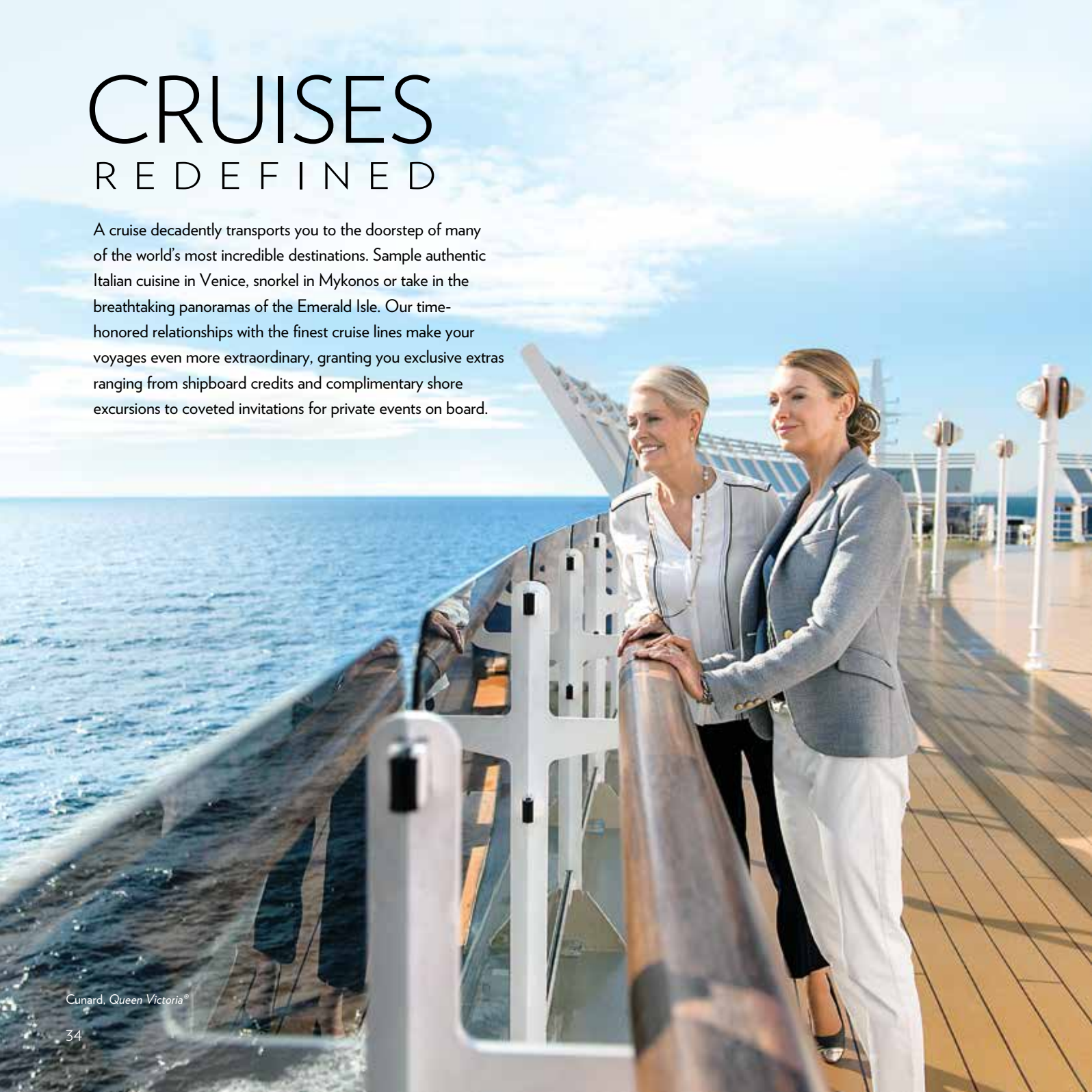
Cunard, Queen Victoria®

A cruise decadently transports you to the doorstep of many of the world's most incredible destinations. Sample authentic Italian cuisine in Venice, snorkel in Mykonos or take in the breathtaking panoramas of the Emerald Isle. Our time-honored relationships with the finest cruise lines make your voyages even more extraordinary, granting you exclusive extras ranging from shipboard credits and complimentary shore excursions to coveted invitations for private events on board.