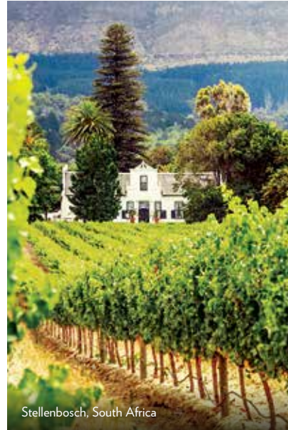
Stellenbosch, South Africa

As a part of Micato Safaris' dedicated nonprofit, Micato-AmericaShare, you'll see a slice of Nairobi life not normally apparent to visitors. Visit the slum of Mukuru where children attend school thanks to Micato's One for One Commitment, which underwrites a child's education for every safari sold, or tour the Harambee Centre erected by past patrons – a hub for studying, community programs and friendly basketball games.