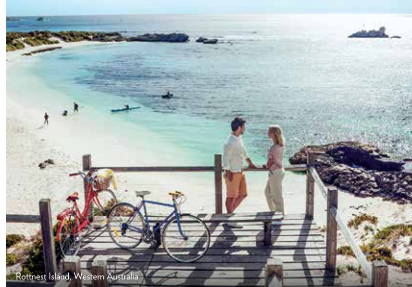
Rottnest Island, Western Australia

through old-growth forests on a guided nocturnal tour to see kangaroos and porcupine-like echidnas at their most active time. Approximately a third of Kangaroo Island is protected, and while you're busy making your way from the sand dunes of Little Sahara to the signature Remarkable Rocks in Flinders Chase National Park you may cross paths with more than one wallaby or opossum. This island is also revered for its locally produced goods, its honey in particular: Kangaroo Island is the oldest bee sanctuary in the world and is home to the only pure strain of ligurian bees, while the Hanson Bay Wildlife Sanctuary comprises 20,000 acres of apiaries.