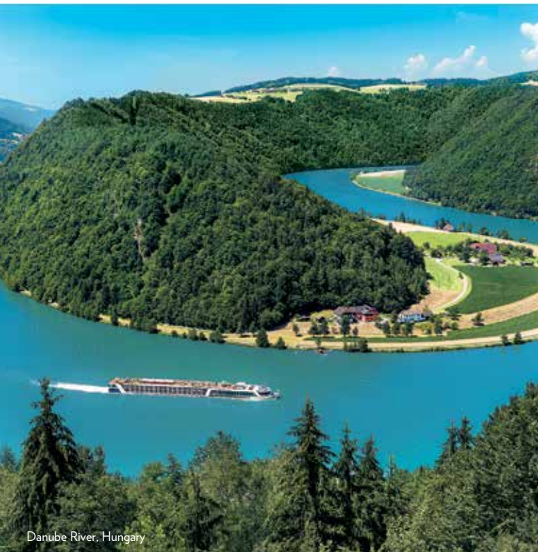
Danube River, Hungary