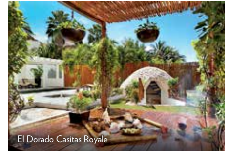
El Dorado Casitas Royale