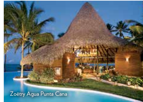
Zoëtry Agua Punta Cana