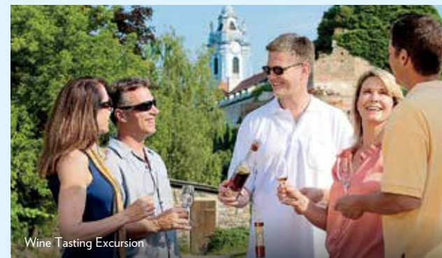
Wine Tasting Excursion

AmaWaterways' river cruises are ideal for travelers going solo. On every sailing in Europe, Asia and Africa, single supplements are waived in select double-occupancy staterooms, when available. Mingle during a cocktail reception and welcome dinner, and find friends on complimentary excursions. Meet new companions at cooking demonstrations and themed dinners. By the time the Captain's Gala Dinner concludes your sailing, you'll have made memories — and friendships — for a lifetime.