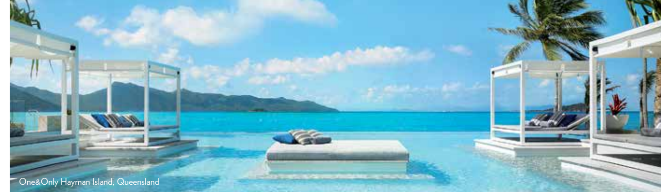
One&Only Hayman Island, Queensland

Australia's islands offer secret, off-the-beaten-trail encounters and surprising forays that foster a deeper appreciation for this vast and varied continent. Whether you're seeking up-close encounters with wildlife, an epicurean tasting tour or a meaningful chance to connect with locals over Aboriginal customs, we can customize an island escape that explores Australia anew.