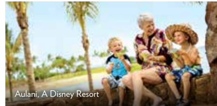
Aulani, A Disney Resort