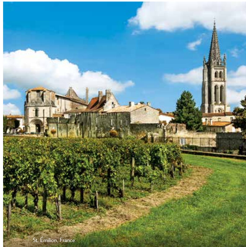
St. Émilion, France