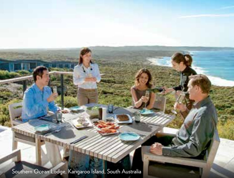
Southern Ocean Lodge, Kangaroo Island, South Australia