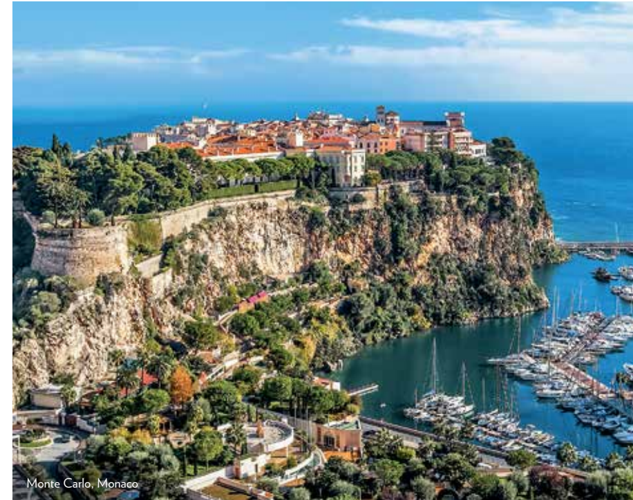
Monte Carlo, Monaco

$250 Shore Excursion credit per couple OFFER M13463