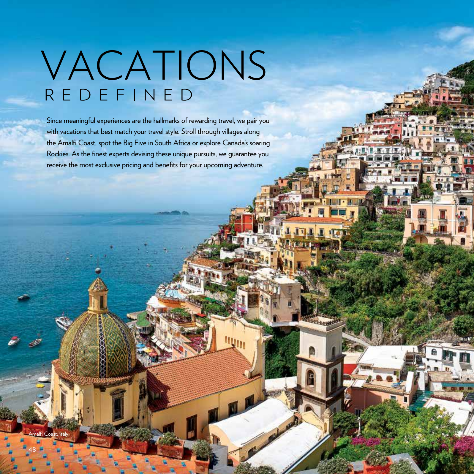
Amalfi Coast, Italy

Since meaningful experiences are the hallmarks of rewarding travel, we pair you with vacations that best match your travel style. Stroll through villages along the Amalfi Coast, spot the Big Five in South Africa or explore Canada's soaring Rockies. As the finest experts devising these unique pursuits, we guarantee you receive the most exclusive pricing and benefits for your upcoming adventure.