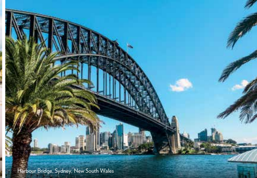
Harbour Bridge, Sydney, New South Wales