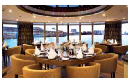
MULTIPLE FINE-DINING VENUES AMAWATERWAYS is a member of La Chaîne des Rôtisseurs. Savor a complimentary tasting menu at the Chef's Table Restaurant or dine at several onboard venues.