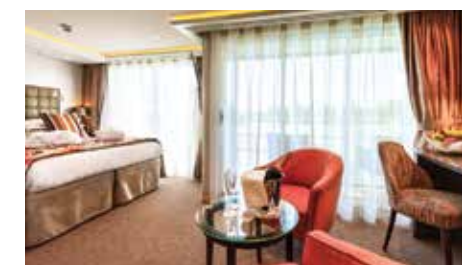
SPACIOUS TWIN BALCONY STATEROOMS Exclusive Twin Balcony staterooms consist of a French Balcony and outside balcony to enjoy the picturesque scenery from the comfort of your stateroom.