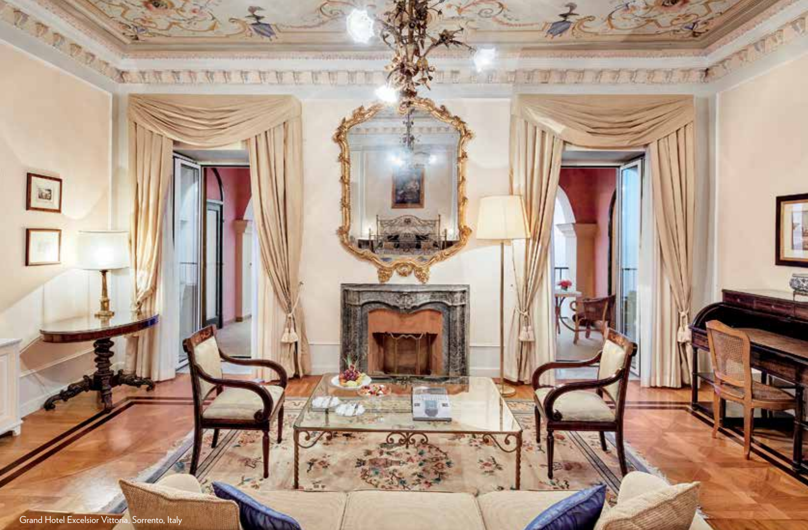
Grand Hotel Excelsior Vittoria, Sorrento, Italy