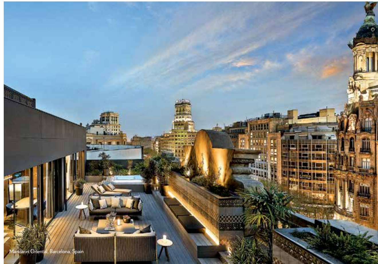
Mandarin Oriental, Barcelona, Spain

FRONT COVER: Arizona Biltmore, A Waldorf Astoria Resort, Phoenix, Arizona