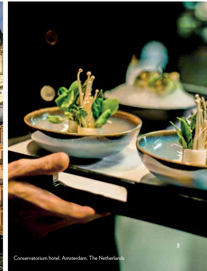
Conservatorium hotel, Amsterdam, The Netherlands