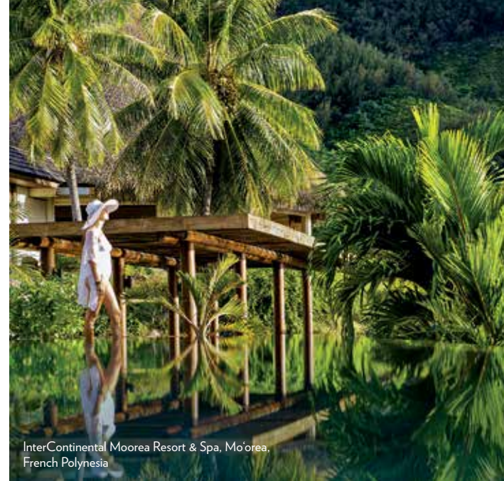
InterContinental Moorea Resort & Spa, Mo'orea, French Polynesia

Enjoy even richer benefits with our exclusive new Suite Privileges. In addition to spacious accommodations, you'll revel in a higher level of service and valuable extras when you reserve select suite categories at participating hotels and resorts worldwide. Turn the page to explore all that you'll receive, then call us to begin planning your next perfect stay.