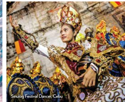
Sinulog Festival Dancer, Cebu