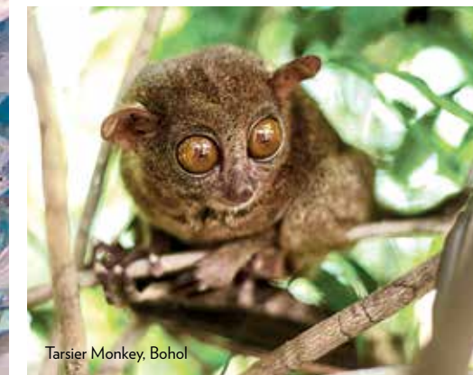
Tarsier Monkey, Bohol

With three islands featured in Travel + Leisure's World's Best Islands list this year, the Philippines are breaking out into the minds of travelers around the world. You'll discover why as you traverse just a few of the more than 7,000 islands that make up the country. The warm and friendly Filipino people will welcome you to unwind on the bright green and white islands with ecosystems that are unlike any in the world. Witness the Chocolate Hills of Bohol, a small island to south of Cebu, and you might just encounter the big-eyed Tarsier monkey, a primate so small that it can fit in the palm of your hand. Indulge your love of watersports and dive into the crystal clear blue waters of Cebu to get up close and personal with a school of brightly colored fish or paddleboard through the calm bay waters. Relax in the island atmosphere and lounge on the soft white-sand beaches of El Nido, on the northernmost part of Palawan Island, consistently voted one of the most beautiful in the world. Enjoy the delicious cuisine from chicken adobo to Halo Halo and make sure to try the rice produced in Banaue, a 2,000-year-old rice terrace that is still used today. No matter what you decide to explore, there is plenty to discover in the Philippines.