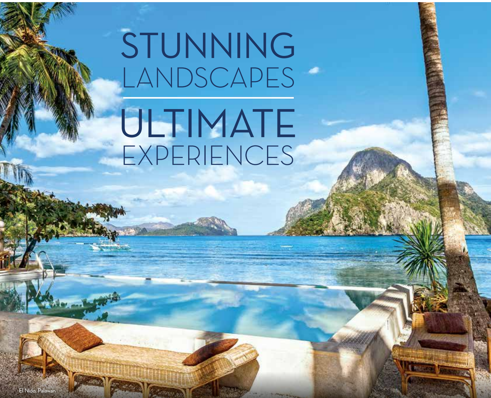
El Nido, Palawan