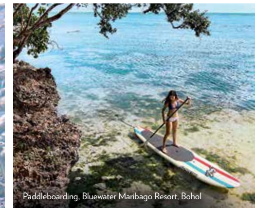
Paddleboarding, Bluewater Maribago Resort, Bohol